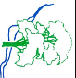
Elm Creek Watershed Management Commission Hydrologic Soil Groups Figure 11-2